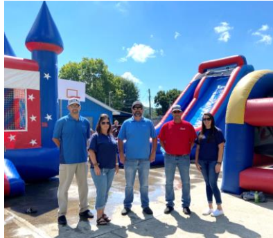
The Carmeuse Crew

Several local businesses supported Camp this summer and enriched our campers' experiences. Carmeuse Lime & Stone threw a party for Camp a week before the end of the summer, complete with lunch, cotton candy and bouncy houses.